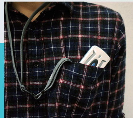
Compact Form Factor