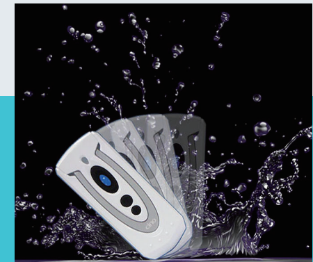
Rugged and Durable