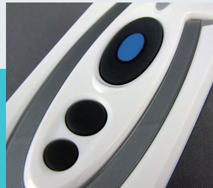
User-friendly Function Keys