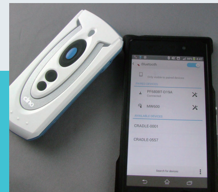
Bluetooth v 4.0 Technology

Cino Bluetooth pocket scanner adopts Bluetooth v4.0, the latest Bluetooth wireless technology. It's completely backward compatible with previous Bluetooth versions and can be integrated with most of Bluetooth host devices seamlessly. Moreover, it comes with more enhancements, such as faster pairing speed, lower power consumption, higher transfer reliability, and less wireless interference.