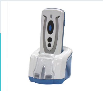
Smart Cradle Solution

Built with the advanced FuzzyScan 3.0 imaging technology, Cino Bluetooth pocket scanner is capable of reading most popular 1D, Linear-stacked, PDF417, GS1 DataBar and Composite barcodes. It can read 13 mil UPC/EAN barcode up to 24" as well as 3 mil high density barcode.