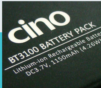
Efficient Power Management