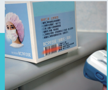
FuzzyScan 3.0 Technology