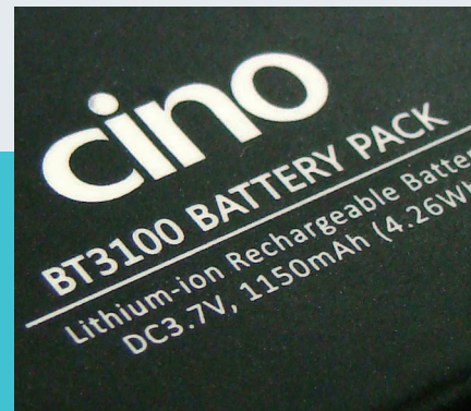
Efficient Power Management