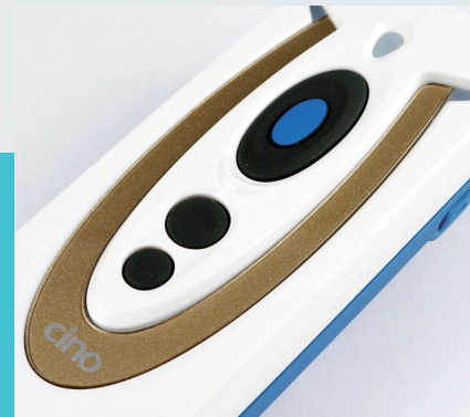
User-friendly Function Keys