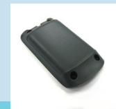
Battery Cover: 1150mAh 2300mAh