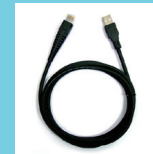
Cable: USB PS/2 RS232 Micro USB