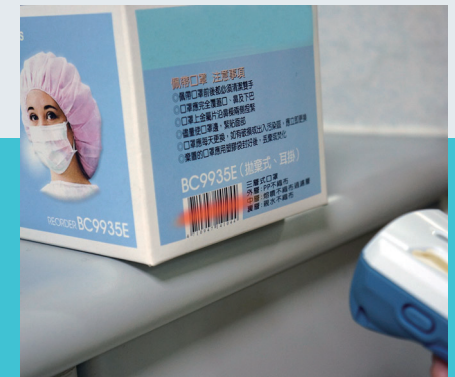
FuzzyScan 3.0 Technology