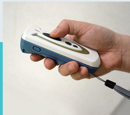
Ergonomic Outer Shell

Cino Bluetooth pocket scanner provides several radio link modes to communicate with most popular host equipments and mobile devices. It not only can connect to non-Bluetooth hosts via working with smart cradle in peer-to-peer (PAIR) mode or multiple-connection (PICO) mode, but also can connect with most of mobile devices, such as smartphones, tablets and notebooks running on Windows, Android or iOS. via HID or SPP mode. The newly-designed HID mode allows you to pair the scanner with mobile devices simply and quickly without entering the passkey.