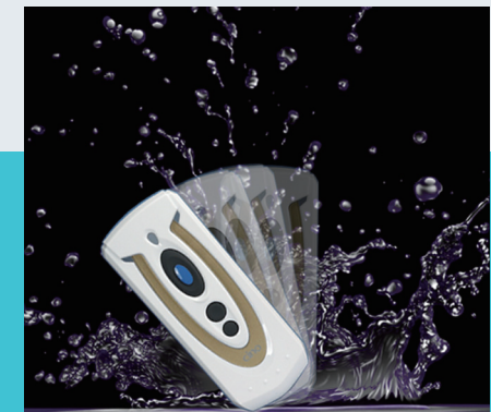
Rugged and Durable