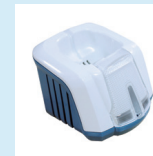
Smart Cradle Charging Cradle