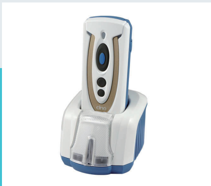
Smart Cradle Solution

Built with the advanced FuzzyScan Imaging Technology 3.0, the Cino Bluetooth pocket scanner is capable of reading most popular 1D, stacked and 2D bar codes omnidirectionally. Besides, it also supports digital image capture which is ideal for vision-related applications.