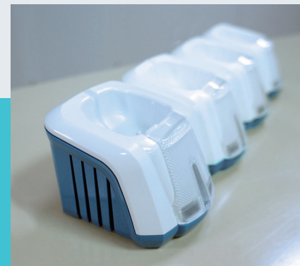
Multi-slot Cradle Solution