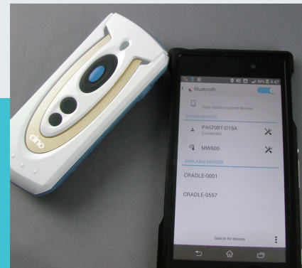
Bluetooth v 4.0 Technology