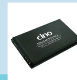
Battery: 1150mAh 2300mAh