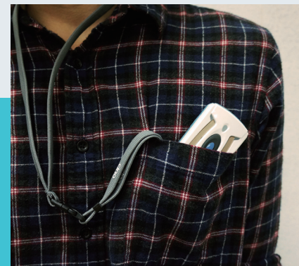
Compact Form Factor