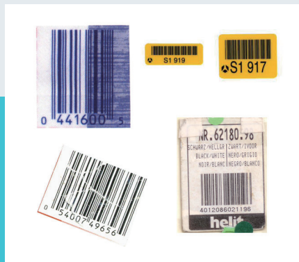
No Worry for Poor Barcodes