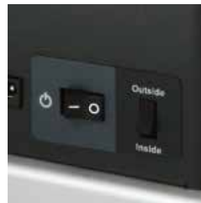
Rewinding direction switch to rewind "inside or outside" label rolls