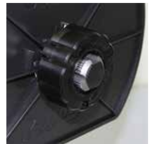
Easy assembly lock module for quickly and firmly label roll holding