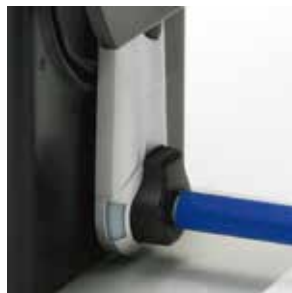
Colored LED indicator provides rewriter operation status