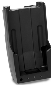
Falcon® 4210 Docking Station

* Minimum distance determined by symbol length & scan length