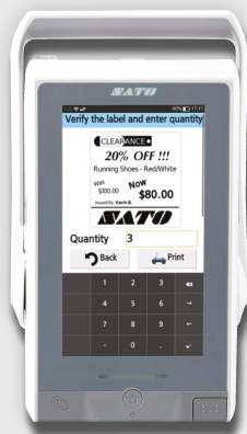
Check Preview & Enter Quantity