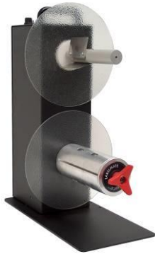
TWIN-CAT-2 Standard / C-76170

LABELMATE's Dual-Spindle Heavy Duty Unwinder / Rewinder, the TWIN-CAT-2 has two powerful motors and your choice of core holders. You therefore have maximum versatility in setting up the operation you need. Both spindles can rewind and unwind. You control the direction and torque on each spindle independently. An External Halt Control allows you to STOP and START the TWIN-CAT-2 with a foot switch or other external device if desired. A worldwide universal switching power supply is included.