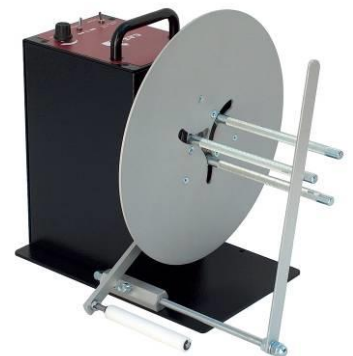
CAT-3-TA-ACH with APG

S-100 or S-200 Label Slitters. Reliable, high quality and maintenance-free.