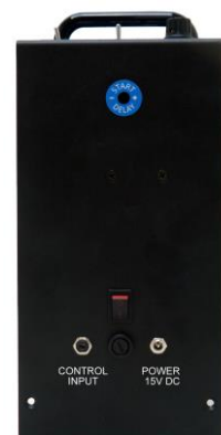
CAT-4 REAR PANEL