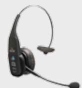
• 94ACC0127 Bluetooth Headset VX1 B350-XT