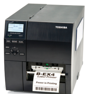
B-EX4 a superior range of industrial printers at midrange price for a wide variety of applications