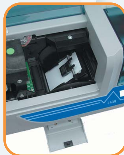
Integral flip-over unit for dual-sided printing

true COLOURS Always use TrueColours™ certified media from NBS Technologies